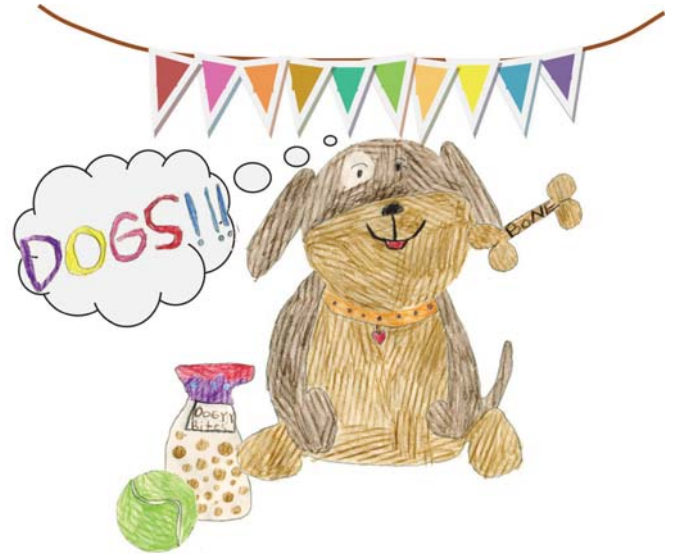
Illustration by Versha

For more information: Visit our Facebook page (Waterbeach Fun Dog Show) or contact Wendy on 01223 526438