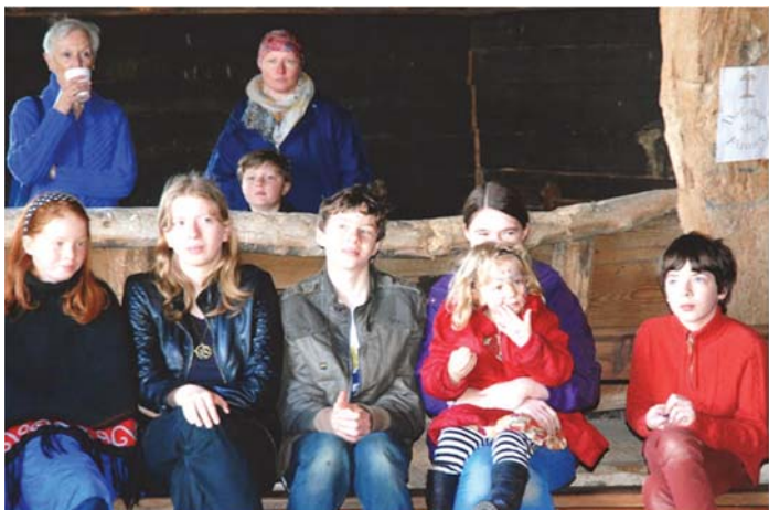
Listening to the story-teller. Tithe Barn, Landbeach